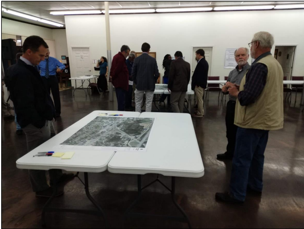
FIGURE 5: PUBLIC DISCUSSION (1 OF 3)