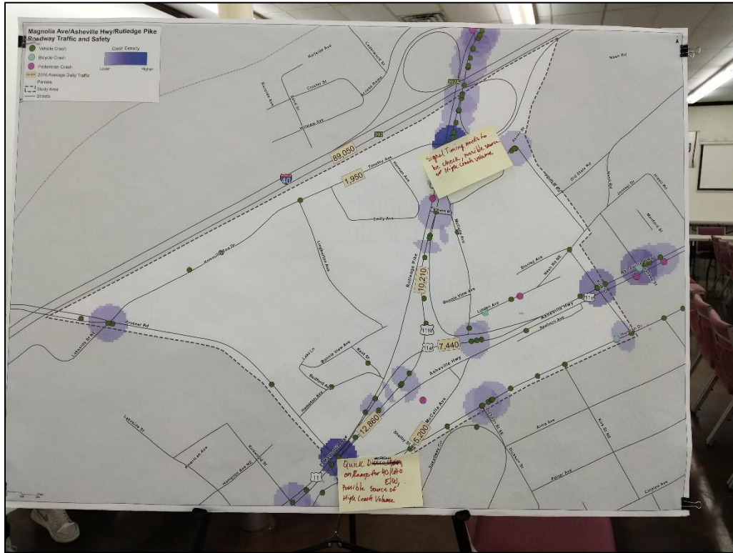
FIGURE 3: ROADWAY TRAFFIC AND SAFETY DISPLAY WITH COMMENTS