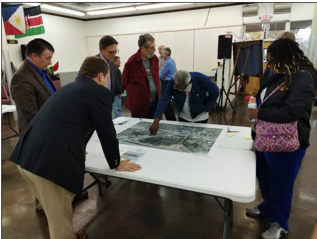
FIGURE 6: PUBLIC DISCUSSION (2 OF 3)