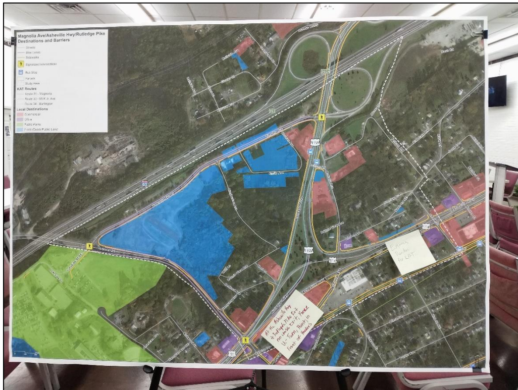
FIGURE 4: DESTINATIONS AND BARRIERS DISPLAY WITH COMMENTS