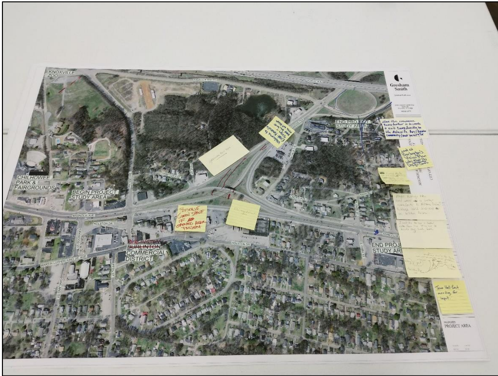
FIGURE 1: STUDY AREA DISPLAY WITH COMMENTS (1 OF 2)