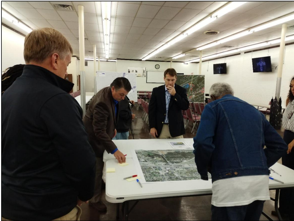
FIGURE 7: PUBLIC DISCUSSION (3 OF 3)